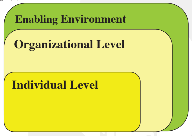
Figure (1): Capacity Building levels.

The objective of improving the institutional capacities of municipalities planning functionality should be enhanced within the following three levels of capacity building as illustrated in Fig. (1):