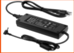
Power Supply 12V