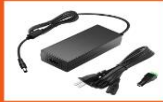
Power Supply 5V