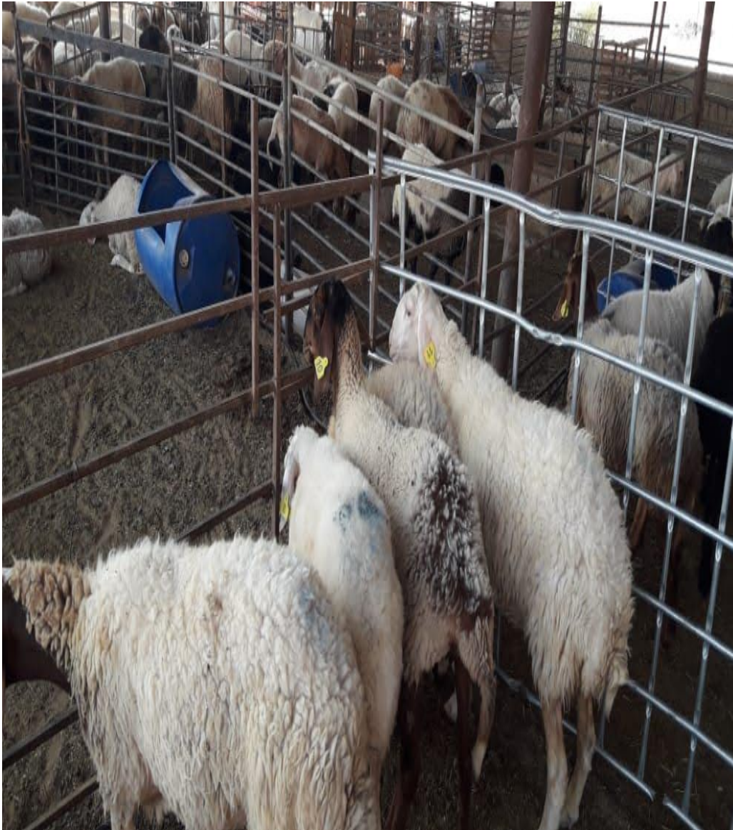
Pens of ewe lambs

Fixed amount of Date Palm Leaves (DPL) with different treatments was fed to the experimental ewes.