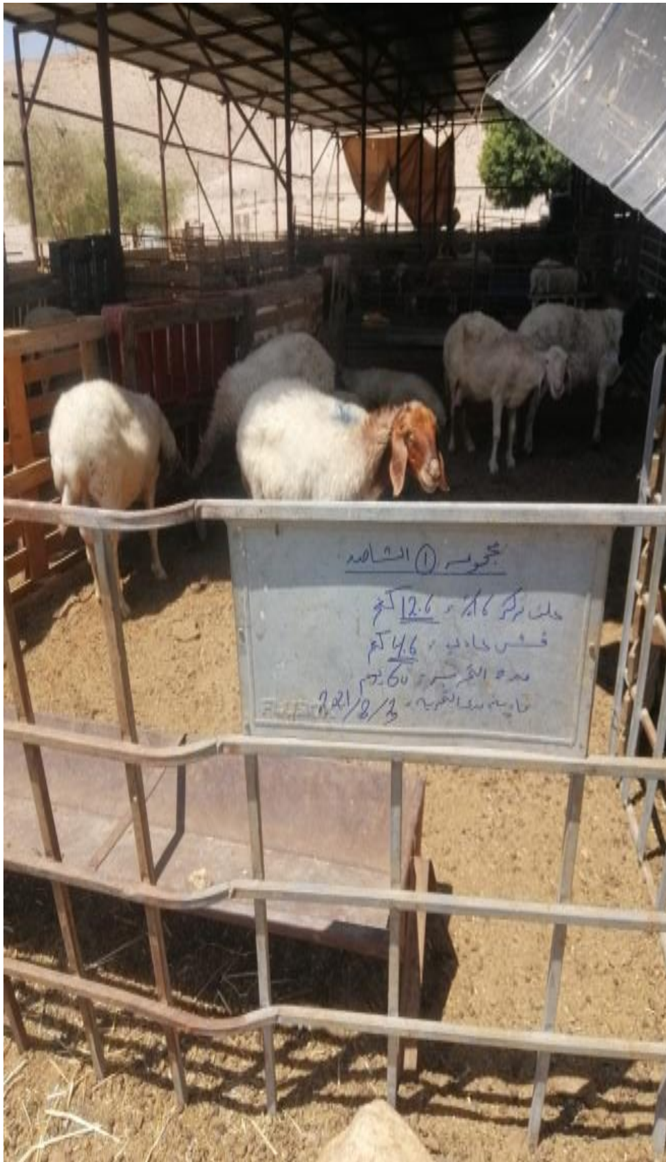
Pens of mature ewes