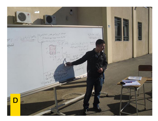
Figure 4: Observations concerning gender and use components.