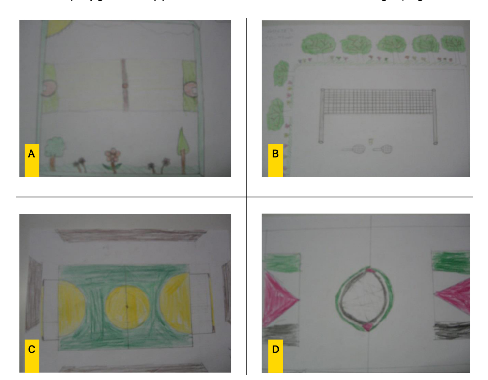
Figure 6: Mental maps drawings: a, b examples of mental maps drawn by female students, c, d examples of mental maps drawn by male students.

The mental maps showed that there are more colours and details in the female students' drawings. In addition, badminton playground appears in most of females' drawings, meanwhile football playground appears in most of the males' drawings (Figure. 6 a, b, c, d).