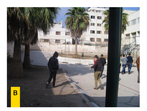
Figure 1: The typical structure of schools a) L-shape with the yard in front b) schools inside residential districts, the yard is surrounded by residential buildings (Source: Authors).