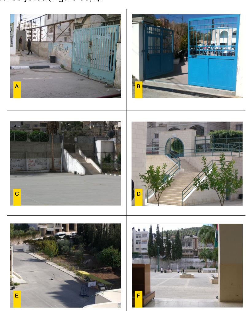
Figure 3: Observations concerning gender and design components (Source: Authors).

Results of the observations showed that girls' schoolyards are mainly located inside or close to the residential neighbourhood, meanwhile boys and educated schoolyards are mostly located outside the residential neighbourhoods. The gates of girls' schoolyards are less transparent than the gates of boys and educated schoolyards (Figure 3a, b). Walls usually surround boys, girls and educated schoolyards; however, walls are higher in the girls' schoolyards than in the boys and educated schoolyards (Figure 3c, d). There are differences between elements of boys, educated and girls' schoolyards. For example, boys and educated schoolyards are always provided with football playgrounds, while the girls' schoolyards are not. More colours are used in girls' schoolyards than in boys and educated schoolyards. Girls' schoolyards contain more seating and shading elements than boys' schoolyard. As well gardens and plants are more evident in girls' schoolyards than in boys and educated schoolyards (Figure 3e, f).