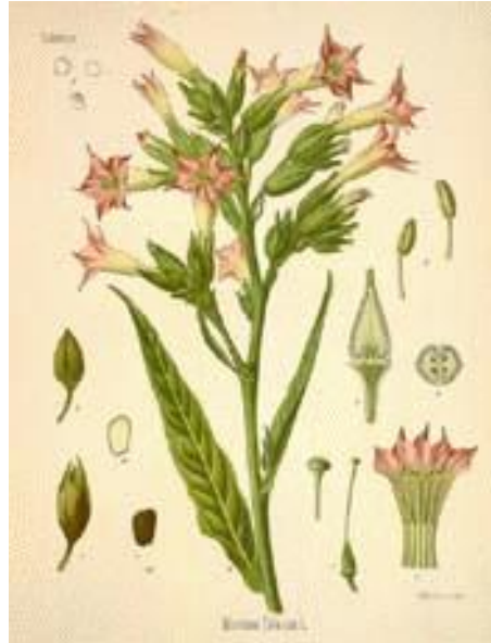
Cultivated Tobacco ( Nicotiana tabacum .)

1.3.2 Habitat: Virginia, America; and cultivated with other species in China, Turkey, Greece, Holland, France, Germany and most subtropical countries.